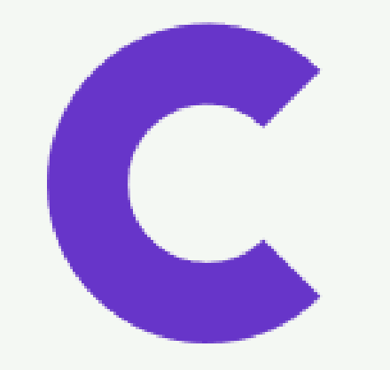
Our Civico platform at civico.net/oadby-wigston

Our website at oadbywigston.gov.uk/meetings